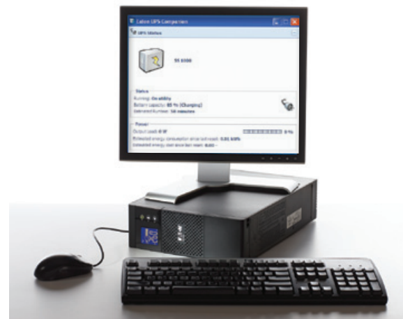
The 5S fits in small spaces and can also be used as a monitor stand.