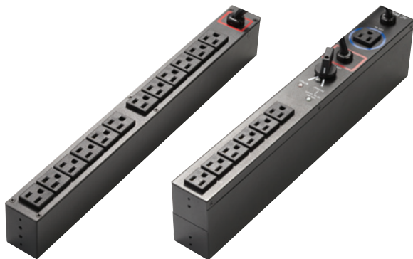
Optional FlexPDU and HotSwap MBP for greater flexibility and uptime